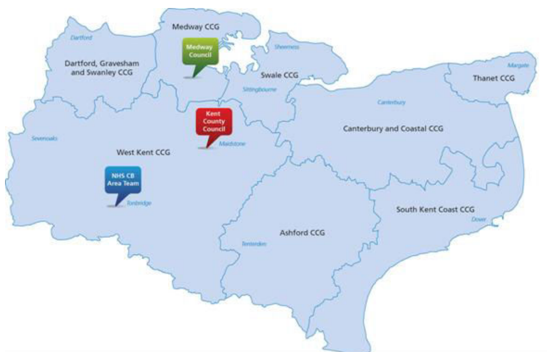
Map 1: CCGs in Kent and Medway 3

(c) There are 8 CCGs covering Kent and Medway, as shown below.